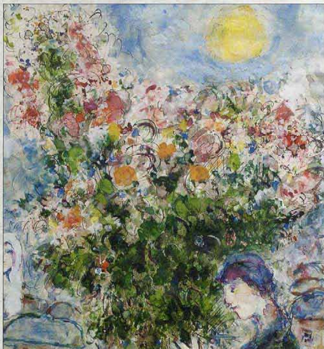
The Farjam Collection

Top: Salvador Dali's 'Le Roi Soleil' shares its title with a fragrance whose bottle the artist designed